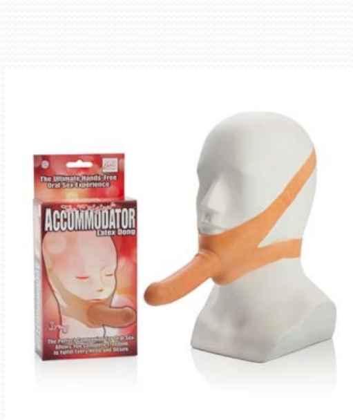
The “Original” Accommodator® Latex Dongs SE-1514-03-3

Known for being used in condoms, some pleasure products are also made with latex. It is a stretchy, pliable material that is sometimes called “natural rubber” as it is made from tree sap. Be aware that latex can cause reactions in people who are allergic to it, and it's important that people who are sensitive avoid latex products.