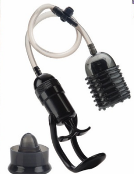
Adonis™ Head Exciter SE-1007-10-3