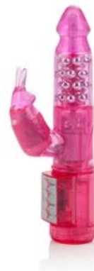
My First Jack Rabbit® SE-0610-05-3