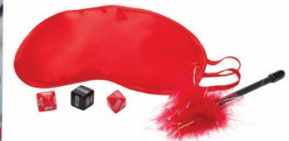
Amour™ Tempt & Tease Romance Kit™ SE-1990-20-3