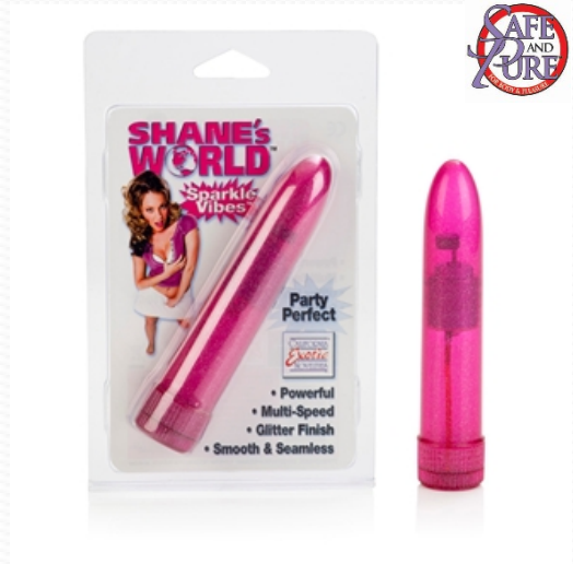
Shane's World ® Sparkle™ Vibes SE-0497-12-2

This is hard plastic and you'll find it in a lot of sex toys. It is smooth, durable, non-porous and easy to clean. Most ABS plastics do not contain phthalates. Since phthalates are a softener, hard plastic by definition doesn't contain it.