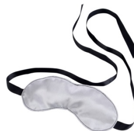
First Time Fetish™ Satin Eye Mask SE-0004-92-3