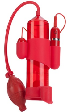
10-Function Adonis® Pump