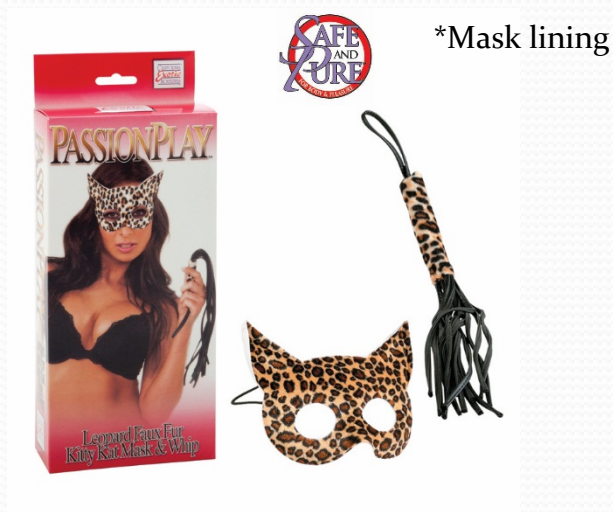
Passion Play™ Kitty Kat Mask & Whip SE-7606-00-3

A polymer that is processed like other thermoplastics. It is non-porous, durable, and Safe and Pure (phthalate-free), as well as flexible and light weight.