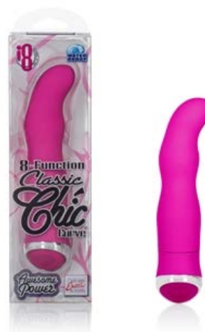
8-Function Classic Chic® Curve SE-0499-85-3