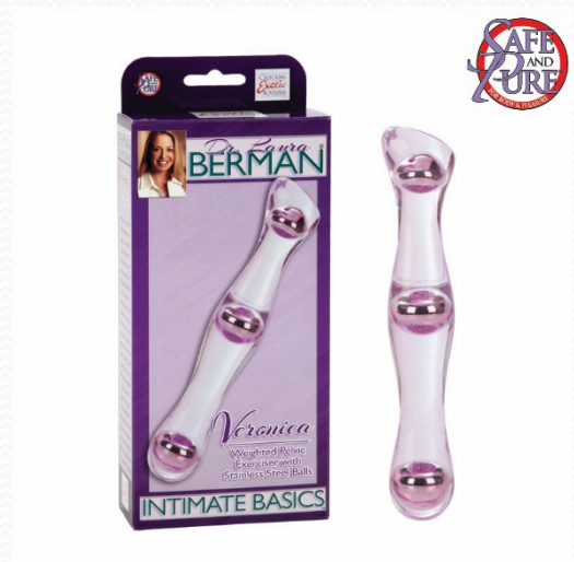
Dr. Laura Berman ® Weighted Pelvic Exerciser with Stainless Steel Balls Veronica™ SE-9710-30-3

A general term for many plastics generated through chemical reaction by applying polymerization and heat. This process creates hard plastics with varying light transmitting properties (clear). Acrylic and Acrylic Resin are phthalate free.